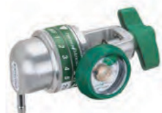
OCD (Oxygen Conserving Device)